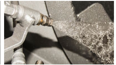
ZONE 4 DRUM (DISCHARGE FIN)