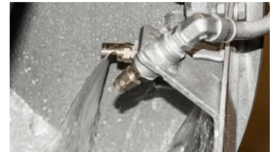
ZONE 2 COLLECTOR