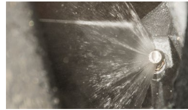
ZONE 3 DRUM (EXTERIOR)